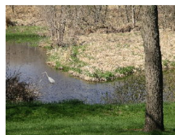
Learn the tools to help protect our native landscapes!

Registration information will be available on the MN