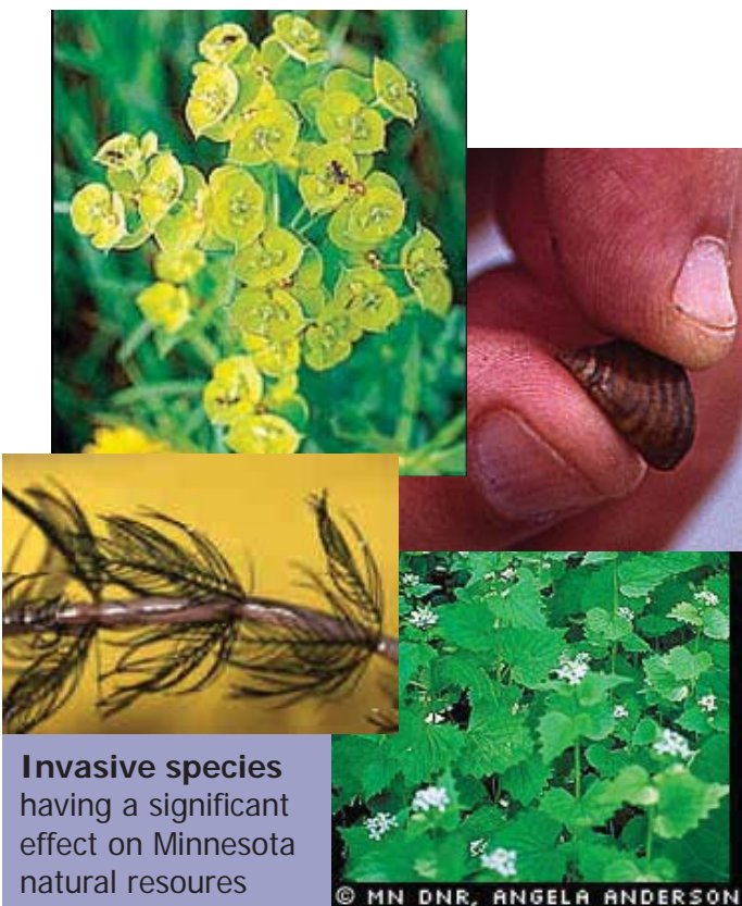
Invasive species having a significant effect on Minnesota natural resources include (clockwise from upper left) leafy spurge, zebra mussels, garlic mustard, and Eurasian milfoil.

Watch the MN SWCS website ( www.minnesotaswcs.org ) for up-dates on registration, sponsorship opportunities, and all the information you want to know about the conference! Mark your calendars - this is a conference that you will not want to miss!